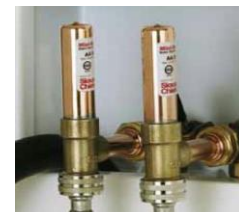
660-H (2 required)

We offer the inline Mini-Rester® for icemakers, dishwashers, and washing machines.