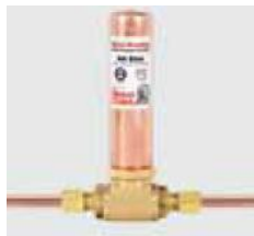
660-TC0 and 660-TR1

Water hammer is caused by the rapid closure of a valve that has water flowing. The picture to the left shows how the water is abruptly stopped by the valve causing tremendous surges in water pressure. A standard household line (50 PSI) when stopped suddenly can cause a spike in water pressure from 250 to 400 PSI. Modern icemaker, dishwasher, and washer valves are designed to fill rapidly and shut off abruptly. This causes water hammer. Water hammer can cause dishwasher supply lines to rupture, washer hoses and valves to burst, and can split or rupture a water filter. Have you ever heard a water valve on your dishwasher, washer, or icemaker thump as it closes? All water valves need the protection of a water hammer arrestor.