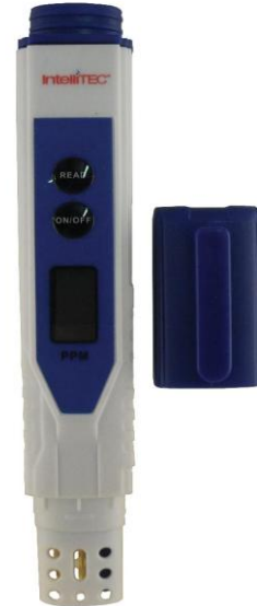
WPT1000 Water Purity Tester